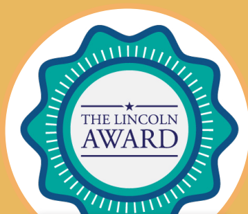
The Lincoln Award