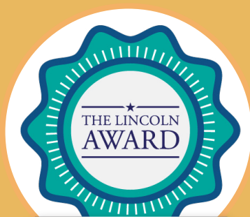
The Lincoln Award