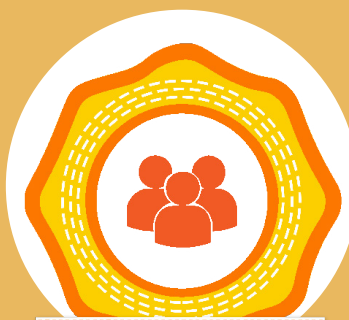
Careers + Employability Workshops